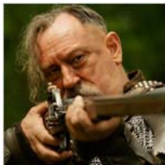
A Wild Cossack Rides Into a Cultural Battle