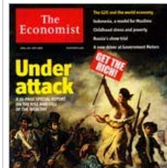
Magazines Think About Raising Prices