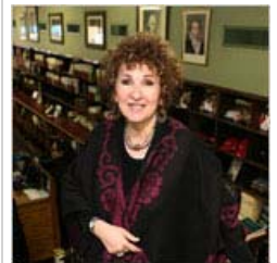
Swan Song for a Music Store and Clubhouse