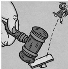
Op-Ed: When to Retire a Justice