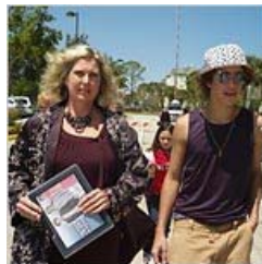
Ban on Sagging Drawers Faces Legal Challenge