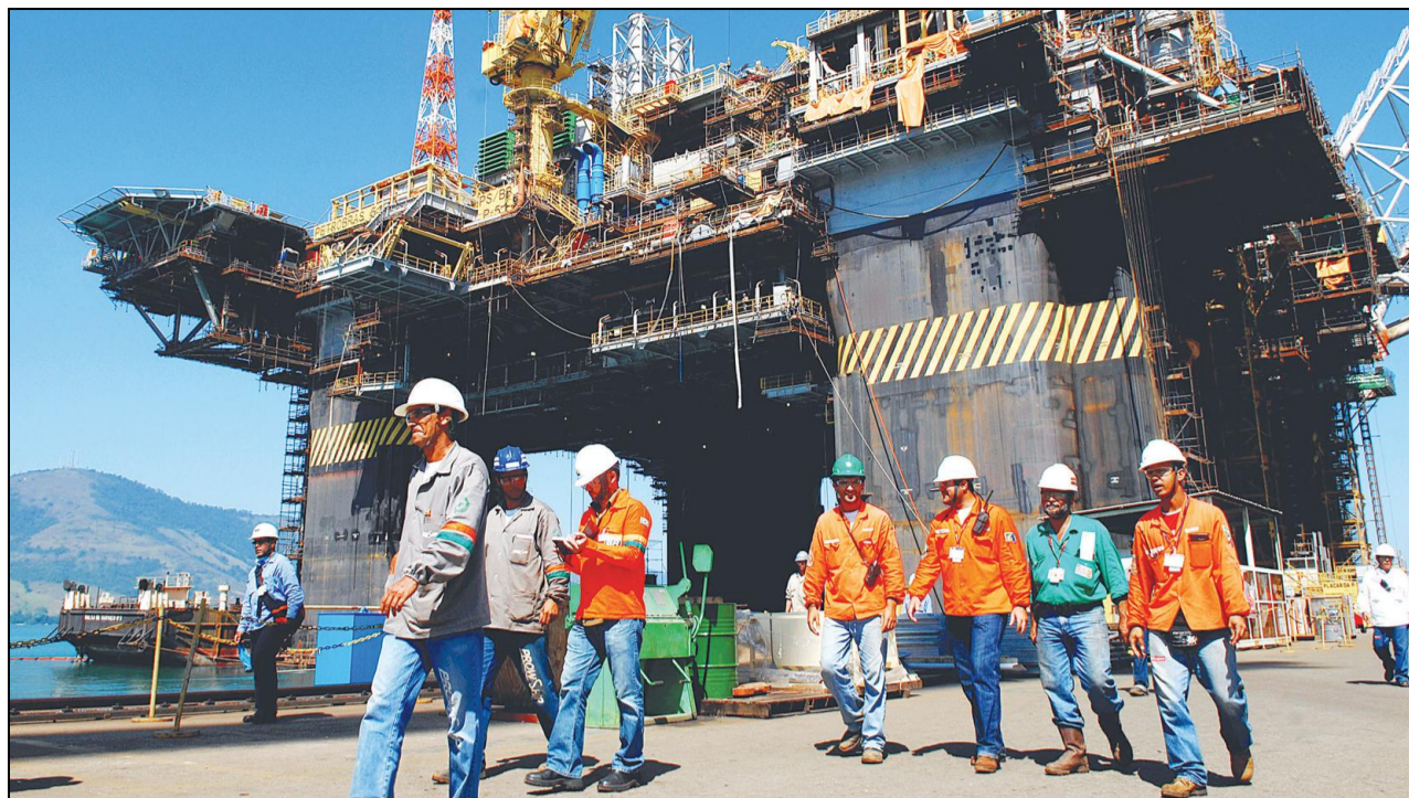
Petrobras has moved closer to realising its goals of ramping production to 3.9m barrels per day oil equivalent by 2014 and 5.4m bpd in 2020.

The Guar  deal has been a long time coming, with a letter of intent issued nearly a year ago to owner Modec and operator Schahin Group. A recent announcement from Modec described plans for the conversion of the 1992-built VLCC Radiant Jewel (ex- Golar Glasgow ) at Cosco Dalian. Topsides will be fitted out in Brazil. Post-conversion, the emergent FPSO Cidade de