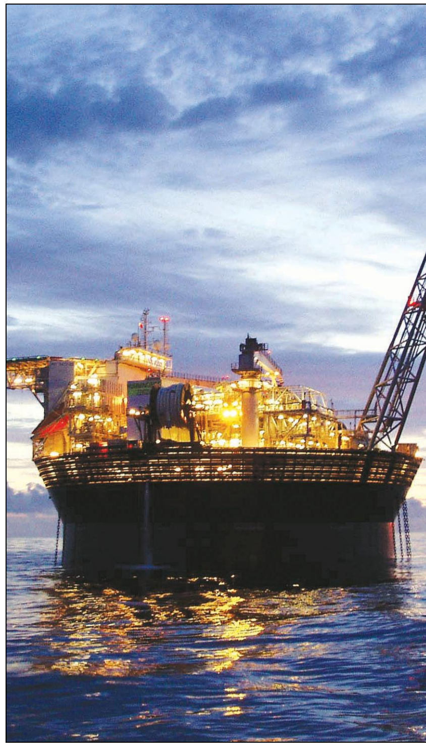
One of Sevan's cylindrical drilling units, the Sevan Hummingbird: Sevan Marine plans a spin-off of its ultra-deepwater drilling assets, but will keep a stake in them and also retain its FPSO business.