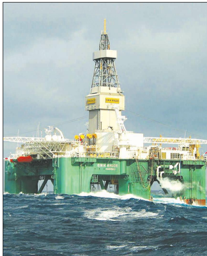
Moderate uncertainties: Ocean Rig's semi-submersible rig Eirik Raude, which is working off Ghana for Tullow Oil, comes off charter in October.

Two additional drillships, with capability to drill in 12,000 ft of water, are scheduled for 2013 delivery, and a third is